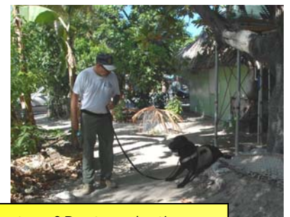
This is a photo of Buster alerting next to a house. He also alerted in their living room (dirt floor). Our geophysics team identified this area as a large US cemetery.