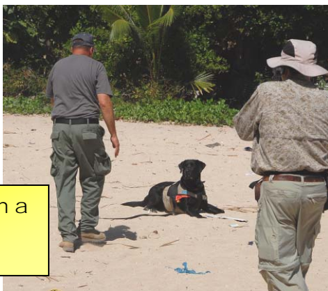
Buster alerting on a trench burial on Green Beach.