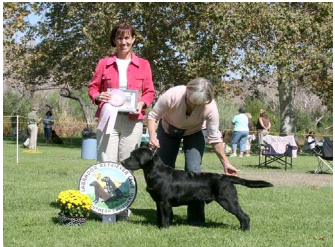
BEST PUPPY OPPOSITE – Saddlehill Jimmy – S. Eberhardt