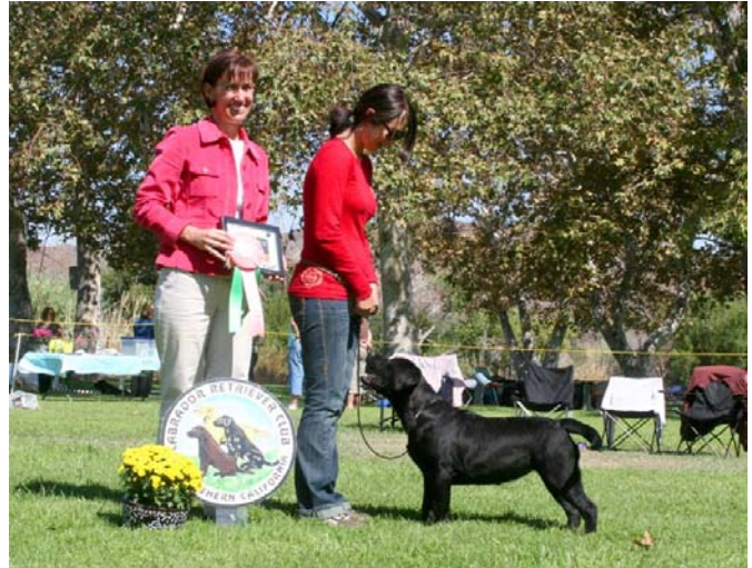
BEST PUPPY – Everwood’s Eloquent Girl at Rushmore – Menchaca / Clark