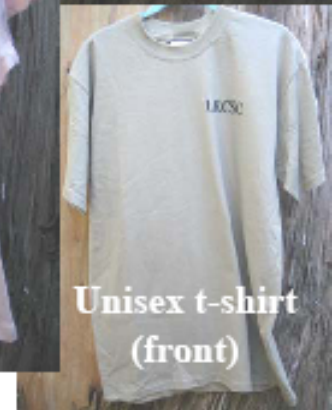
Unisex t-shirt (front)