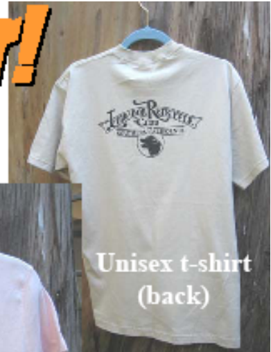
Unisex t-shirt (back)