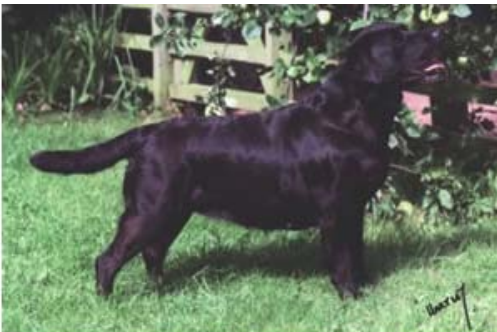
SH. CH. FOXRUSH BLUE SAPPHIRE SIRE ROCHEBY NAVY BLUE (1 CC) DAM SH. CH. FOXRUSH PEACH BLOSUM HIPS 7/5

I imported a yellow bitch from Norway who soon gained her title, Ch. Aditis Becky of Foxrush. She was related to a dog I exported, Norwegian Ch. Foxrush Pioneer. Becky won a total of 4 C.C.'s. Sh. Ch. Foxrush Peach Blossom was born in 1991, by Poolstead Pretentious of Rocheby out of Foxrush Charisma (1 C.C.). In all she won a total of 13 C.C.'s and 7 Res. C.C.'s. The yellow dog SH. CH. Foxrush Prime Suspect was made up in 1998. He has 4 C.C.'s all with best of breed and 4 Res. C.C.'s.