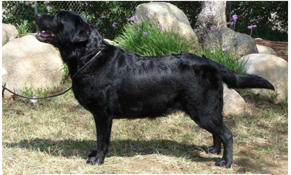
Ch. Kintra's Basic Black. Finished that day July 4th. 2007 ( Ch. Brooklands Hampshire Bucky & Kintra's Wild Abanden )

My re-introduction to owning a Labrador came in 1987 when a yellow female came into my life as a gift