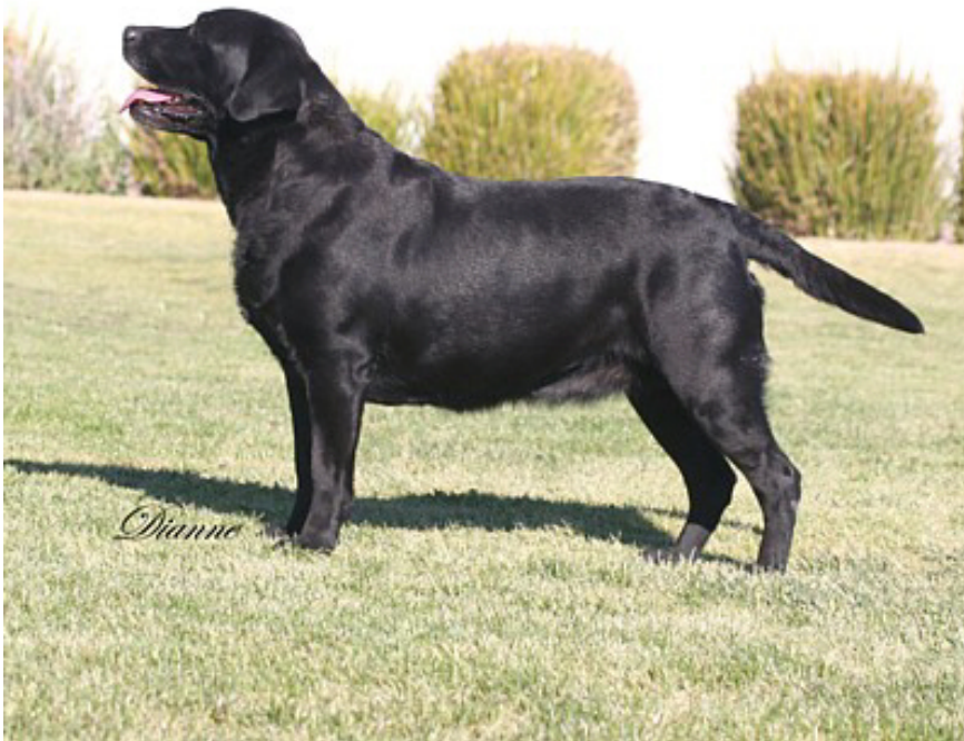
Kintra's Blue Moon Serenade ( Kintra's Four Leaf Clover X Hyspires Once In A Blue Moon)