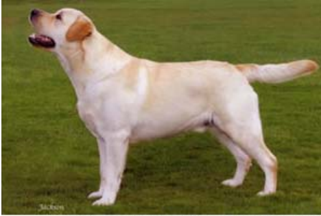
FOXRUSH DICK FRANCIS (1 CC / 2 RES. CC) SIRE SH. CH. BRAUNSPATH DISCOVERY (J.W) DAM SH. CH. FOXRUSH BLUE SAPPHIRE HIPS 2/3

The kennel was founded in 1968 with a yellow bitch from the late Gwen Broadley, called Foxrush Sandylands Gaytime. From her first litter came Foxrush Bo-Peep (Res. C.C.) Until I retired from business 10 years ago few litters were bred at Foxrush, but, puppies bought in proved highly successful.