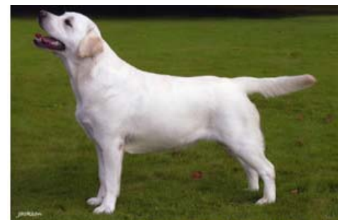
SH. CH. FOXRUSH OVALTINE, J.W. SIRE ROCHEBY OLD SMOKEY DAM SH. CH. FOXRUSH GISELLE

In 2009 Sh Ch Foxrush Ovaltine, J.W. gained her title after being Top Labrador Puppy and overall Top Gundog Puppy. 2010 started with a new champion for the Foxrush Kennel, SH. CH. Sretlaw Spring Connection with Foxrush.