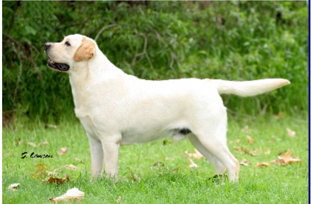
Ch. Kintra's Tatonka at Pathfinder ( Ch. Kintra's Highland Dancer X Ch. Decoy's Believe It Or Not. ) Tonka also finished up in Ventura on the Saturday and my black bitch Ch. Kintra's Basic Black finished the next day. What a weekend that was.