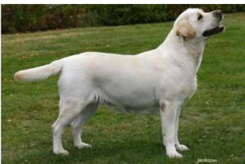
SH. CH. SRETLAW SPRING CONNECTION WITH FOXRUSH SIRE SH. CH. ROCHEBY STATESMAN DAM SRETLAW KISS ME KATE HIPS 3/4

In 2002 SH. CH. Foxrush Blue Sapphire gained her title (She now has 5 C.C.'s.). In 2006 SH. CH. Foxrush Giselle became another Foxrush bred Champion. Foxrush champions live in U.S.A, Australia, Sweden, Belgium, Italy, Iceland and Spain. I was honoured to be invited to judge Labradors at CRUFTS in 1997. I have also officiated at the Labrador Retriever Club and Yellow Labrador Club Championship Shows. Judging has taken me to all corners of the world (U.S.A, Australia, New Zealand, Japan, Canada, Mexico, Phillipines and many European Countries). I also use the KC/BVA Health Schemes.